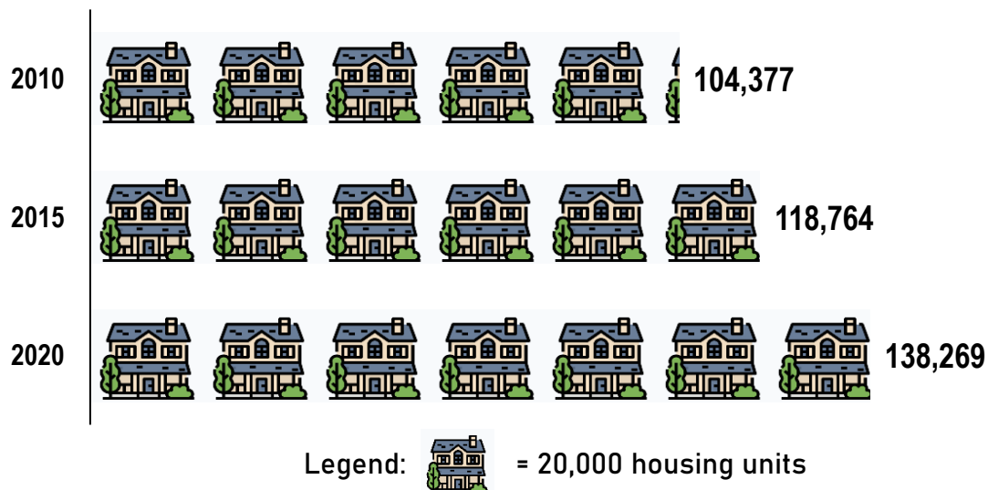
Figure 1. Total Housing Units: Occidental Mindoro, Census Years 2010 - 2020

Source: Philippine Statistics Authority, Various Census Results