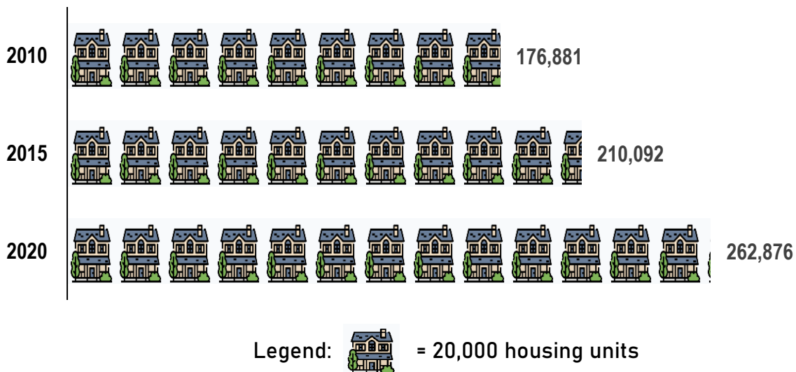
Figure 1. Total Housing Units: Palawan 1/ , Census Years 2010 - 2020

Note: 1/ Excluding the highly urbanized City of Puerto Princesa Source: Philippine Statistics Authority, Various Census Results