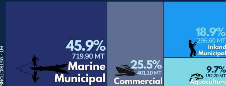
Value of Production by Subsector