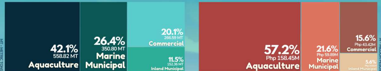
Value of Production by Subsector