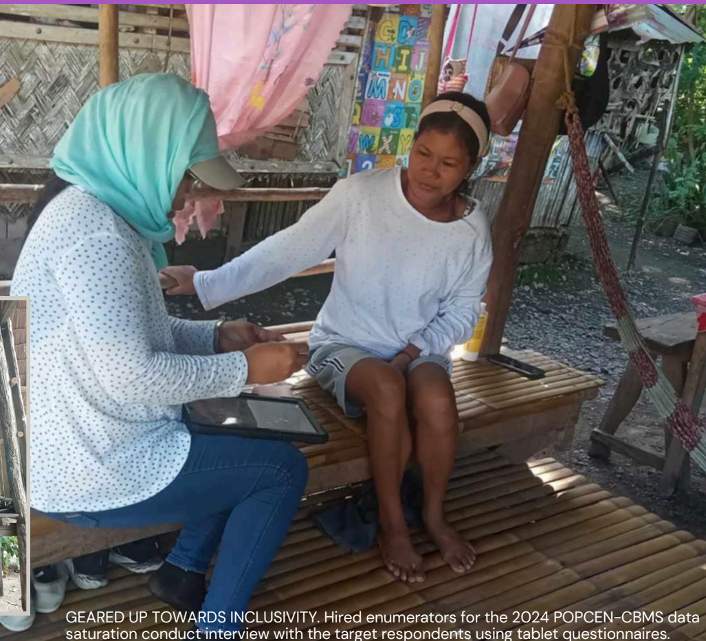
GEARED UP TOWARDS INCLUSIVITY. Hired enumerators for the 2024 POPCEN-CBMS data saturation conduct interview with the target respondents using tablet questionnaires.