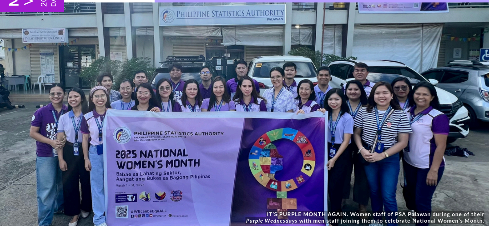
IT'S PURPLE MONTH AGAIN. Women staff of PSA Palawan during one of their Purple Wednesdays with men staff joining them to celebrate National Women's Month.

THE OFFICIAL MONTHLY NEWSLETTER OF THE PROVINCIAL STATISTICAL OFFICE OF PALAWAN