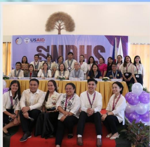
2022 NDHS Dissemination Forum