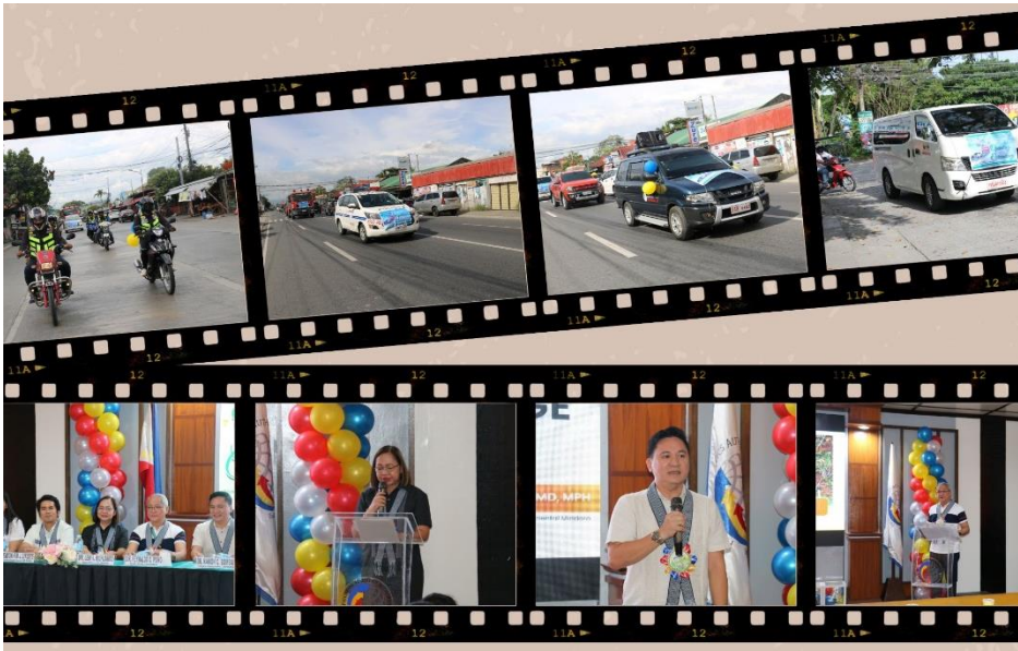
• Opening Ceremony