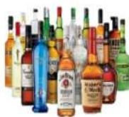
Alcoholic Beverages and Tobacco