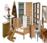
Furnishing, Household Equipment, and Routine Maintenance of the House