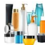
Personal Care and Miscellaneous Goods and Services