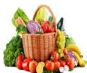
Food and Non-alcoholic Beverages and Tobacco