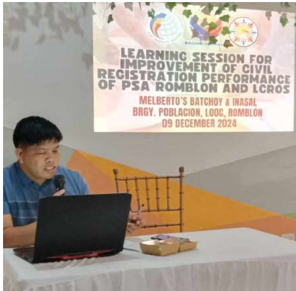
LEARNING SESSION FOR IMPROVEMENT OF CIVIL REGISTRATION PERFORMANCE OF PSA ROMBLON AND LCROS MELBERTO'S BATCHOY & INASAL BRGY. POBLACION, LOOC, ROMBLON 09 DECEMBER 2024

Objective of the activity to inform the LCROs of the process of reporting activities conducted in their level including the documentary requirements to be submitted to PSA for rating. Also, they were presented with the LCRO Awards Manual to serve as their guide in doing these documentations.