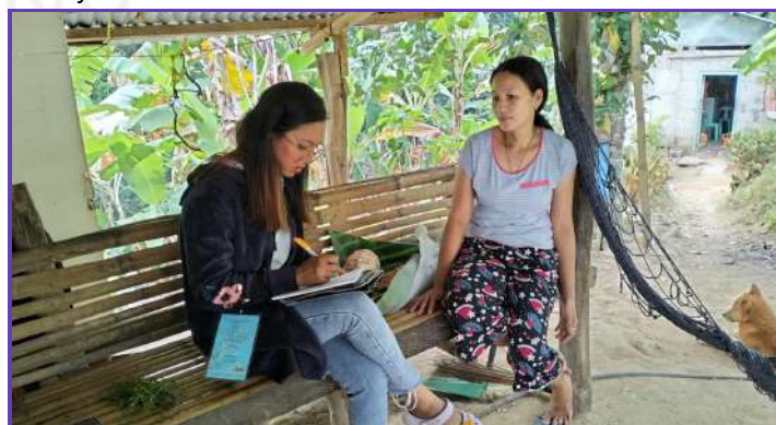
In frame, SR Faz during collection of data from a sample in the 1st Quarter Crops Production Survey.