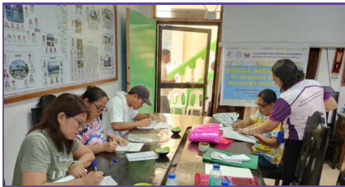
13 March 2024 - Alcantara National High School