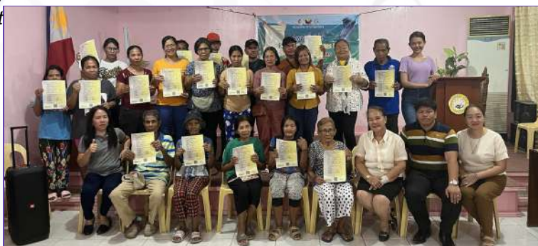
SECPA awarding to BRAP beneficiaries at Session Hall, Santa Fe, Romblon.

The Birth Registration Assistance Project (BRAP) will continue its commitments to facilitate the registration, ensuring that all Filipino births are registered in the Local Civil Registry Offices.