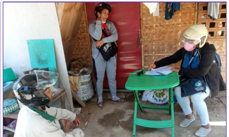
SR Montesa (right photo) SR Galit (left photo) during data collection in the 1st quarter Commercial Livestock and Poultry Survey (CLPS).

The CLPS is conducted quarterly in all provinces, including the National Capital Region (NCR). Moreover, the commodity coverage includes carabao, cattle, swine, goat, sheep, chicken, duck, and other animals tended/raised by the establishments.