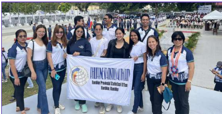
PSA employees taking a photo during program at Romblon Capitol building ground.