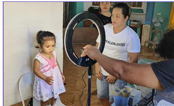
During registration of 0-4 years old to PhilSys together with their parents/guardians.

The only documents required for registering with PhilSys if the child is younger than five years old is the PSA/LCR Birth Certificate, along with the guardian's presence and PhilID/ePhilID card.