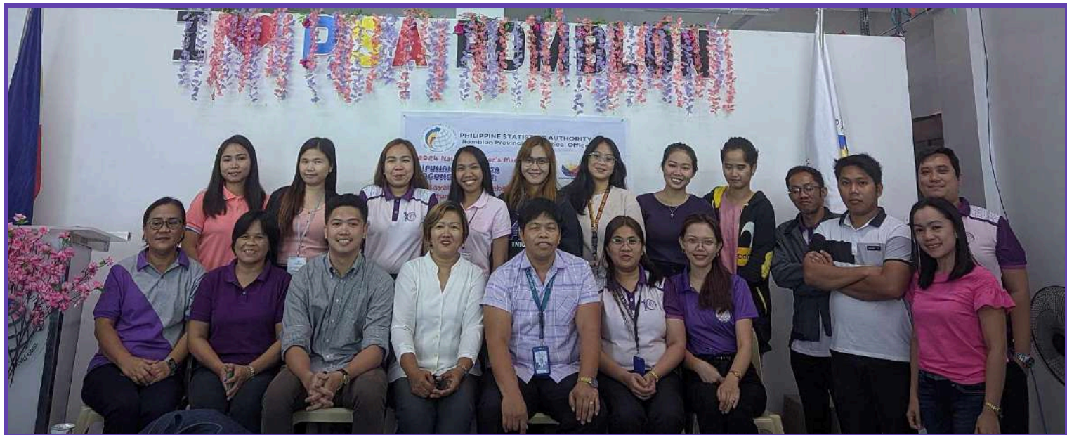
Resource speakers and participants of the Seminar on RA 9262, RA 11313 and RA 6725