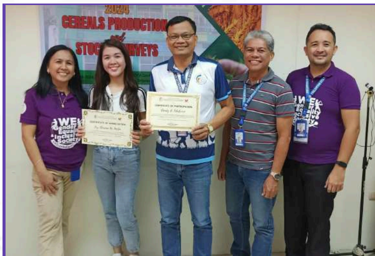
Awarding of Certificates to PSA Romblon employees.

The introduction of CAPI in Cereals production and Stocks survey is a welcome development hence, it will improve the cycle time in survey operations by eliminating processes such as printing of questionnaires, manual editing, and machine processing of questionnaires. It will be implemented as mode of data collection for Cereals production and stocks surveys starting first quarter of 2024.