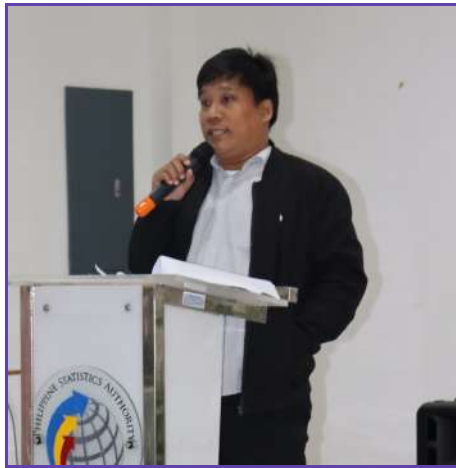
SrSS during his discussion of the highlights of the 2022 CBMS findings.

SrSS Morada presented the highlights of the 2022 CBMS findings. Along with RD, CSS, Municipal Mayors, MPDCs and witnesses, the Data Turnover Agreement was then signed. The Municipal Mayors, Vice Mayor and representatives of the twelve (12) LGUs then expressed their acceptance messages. They expressed their appreciation for the enumerators' efforts and gratefully thanked PSA. They also assured that the LGU would ensure the data's security and that it would be utilized for the development of the community.