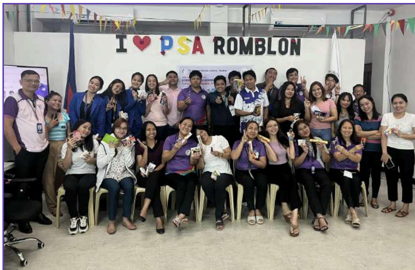
PSA employees, highlighting female employees with their received gifts.