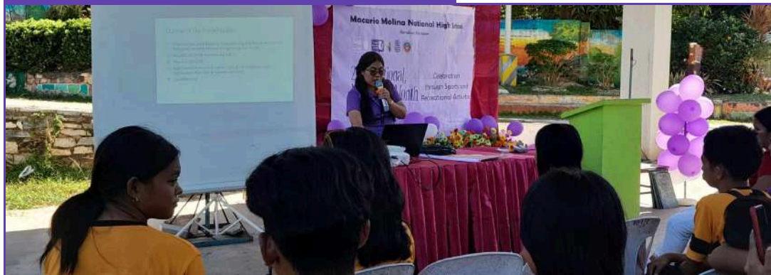
09 March 2024 - Macario Molina National High School

As part of the 2024 National Women's Month, with a theme "LIPUNANG PATAS SA BAGONG PILIPINAS: Kakayahan ng Kababaihan, Patutunayan!", the Philippine Statistics Authority-Romblon Provincial Statistical Office conducted various information dissemination on Gender Statistics.