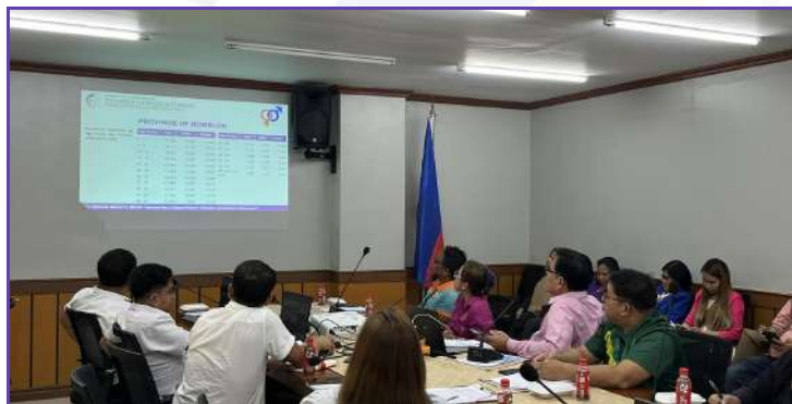
25 March 2024 - Governor's Office, Capitol Building, Brgy. Capaclan, Romblon, Romblon

As part of the 2024 National Women's Month, with a theme "LIPUNANG PATAS SA BAGONG PILIPINAS: Kakayahan ng Kababaihan, Patutunayan!", the Philippine Statistics Authority-Romblon Provincial Statistical Office conducted various information dissemination on Gender Statistics.