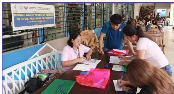
15 March 2024 - Looc National High School