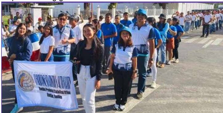
PSA employees and OJTs joining the civic parade.

In line with the joint 123rd Foundation and 79th Liberation anniversary of the province of Romblon, PSA Romblon participated the celebration program last March 16, 2024 at 8:00 in the morning at Romblon Provincial Capitol Ground, Brgy. Capaclan, Romblon.