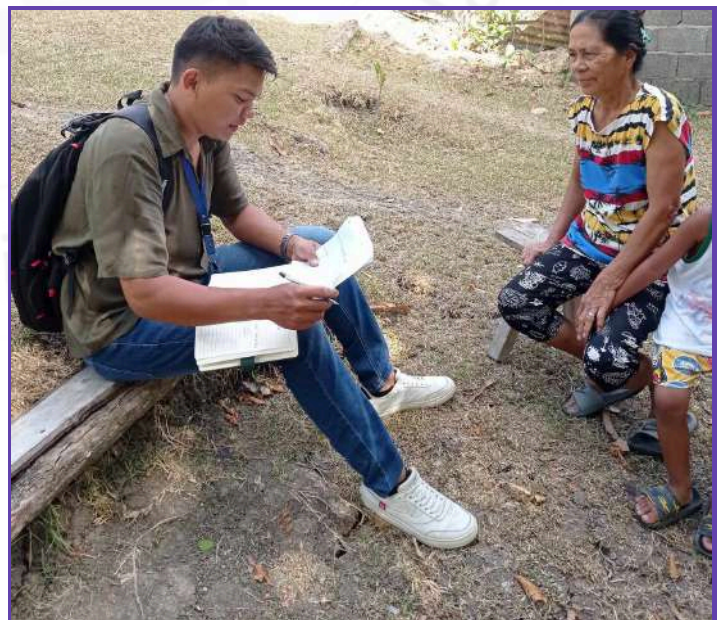
SR Sediaco as he interviews farmer as one of the samples in the Farm Price Survey.

PSA, meanwhile, guarantees that the data provided by sample respondents will be treated with utmost confidentiality because it fully complies with Republic Act No. 10173, also known as the Data Privacy Act of 2012, which aims to protect personal data in government and private sector information and communication systems.