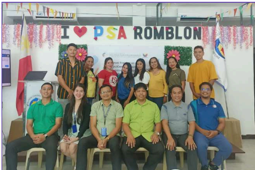
In frame, trainers and participants during Third Level Training on 2024 Cereals and Stocks Survey.