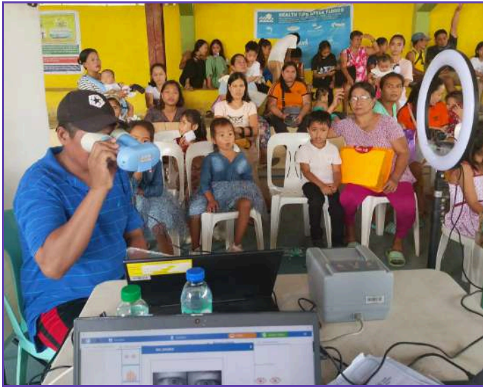
A resident of Santa Fe, Romblon during scanning of iris.

Data shows that the PSO reached 87.12 percent of its the target population for Romblon. With 5 operational kits, continuous saturation in municipalities was conducted by the PhilSys teams deployed in the islands of Sibuyan, Romblon and Tablas. They were dedicated enough to seek for more registrants notwithstanding challenges brought about by the province's geographical setting.