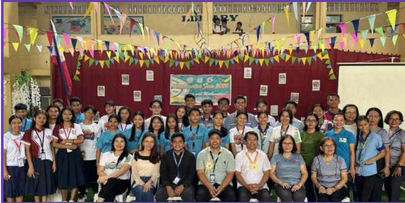
PSA employees, together with Math Club officers and teachers of RNHS during opening program of Math Fair.

On March 14, 2024, Romblon National High School (RNHS), celebrated the International Day of Mathematics by conducting the Mathematics Fair 2024 at RNHS, Bagacay, Romblon, Romblon with the theme "Playing with Mathematics."