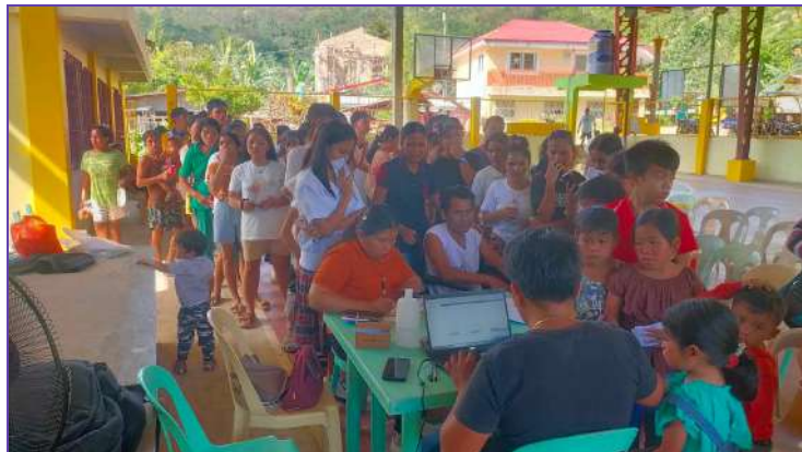
4Ps beneficiaries in Brgy. Li-o, Romblon, Romblon as they fall in for authentication during DFS.