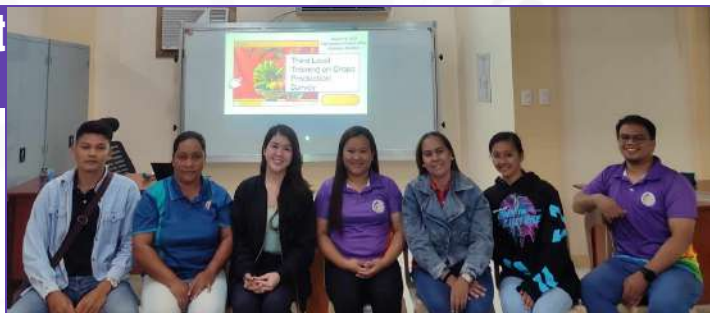
SA Garcia and SA Motin as trainers with COSW Salvador, together with SRs during Third Level Training on Quarterly Crops Production Survey

The Crops Production Survey (CrPS) is one of the major agricultural surveys conducted by the Philippine Statistics Authority (PSA) to generate estimates on the volume of production, area planted/harvested, number of bearing trees/hills/vines, and farmgate prices for crops other than palay and corn at the national and sub-national levels.