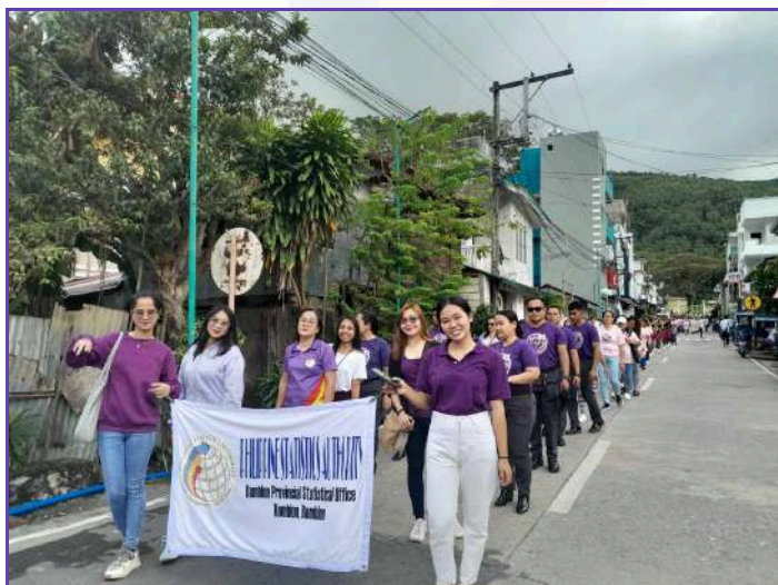
Female PSA employees and OJTs during the unity walk.

PSA-Romblon Provincial Statistical Office was invited in the GADvocacy /Unity walk in the celebration of the 2024 National Women's Month with the theme "Lipunang Patas sa Bagong Pilipinas: Kakayahan ng Kababaihan, Patunayan!" last March 12, 2024, 8:00am at Romblon Public Theater.