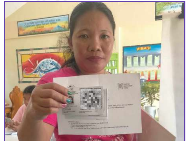
PhilSys registrant who received her ePhilID minutes after the registration.