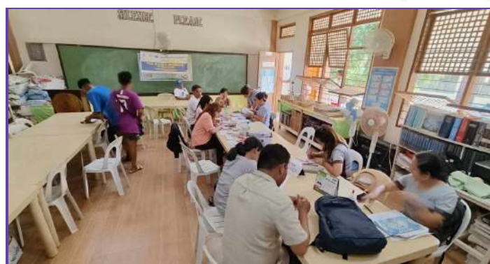
13 March 2024 - Romblon National High School

As expressed in the theme "CRVS: The Future of Seamless Services," PSA's commitment to facilitating faster, easier, and more convenient civil registration is highlighted by the 34th CRM celebration last February 2024.