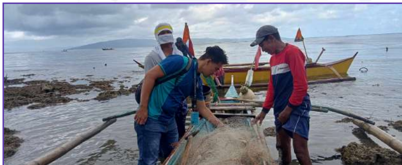
SR Pastor as he checks the caught fish of a fisherman as one of the samples in the 1st Quarter Aquaculture and Inland.

A total of six (6) statistical researchers were trained for two (2) days and discussed the concepts and procedures to produce quality data. The quarterly inland and aquaculture fisheries survey enumeration period was conducted on 11 to 22 March 2024 on the selected sample barangays in the Province of Romblon.