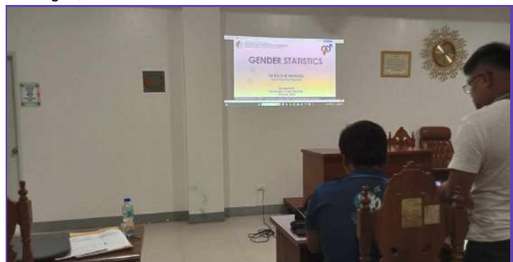
08 March 2024 - 2/F Session Hall, Looc Municipal Building, Looc, Romblon

Highlighted in the discussions were the results from the 2020 Census of Population and Housing Household Population by Age, Age Sex Pyramid, Sex Ratio, School Age Population, Senior Citizen, Voting Age Population, Selected Vital Statistics on Birth, Marriage and Death and Most Common Names in the Philippines.