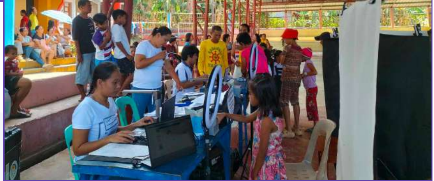
PhilSys registration at Brgy. Taclobo, San Fernando, Romblon during FDS.

Considering its efforts to capture more registrants by ramping BLGU-based registrations, PSA-Romblon covered 73.43 percent of its target workload (2,875) for Step 2 registration for the month of March 2024 with 2,111 successful registrations. From June 21, 2021 to March 31, 2024, a total of 244,218 Romblomanons are now PhilSys-registered.