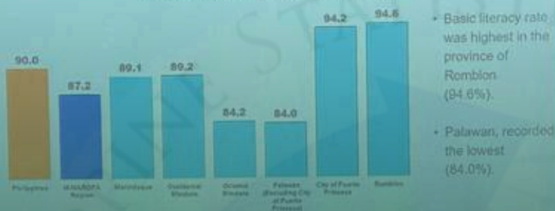
Figure 2: Basic Literacy Rate of Population 5 Years Old and Over by Province, MIMAROPA Region, 2024 (in percent)