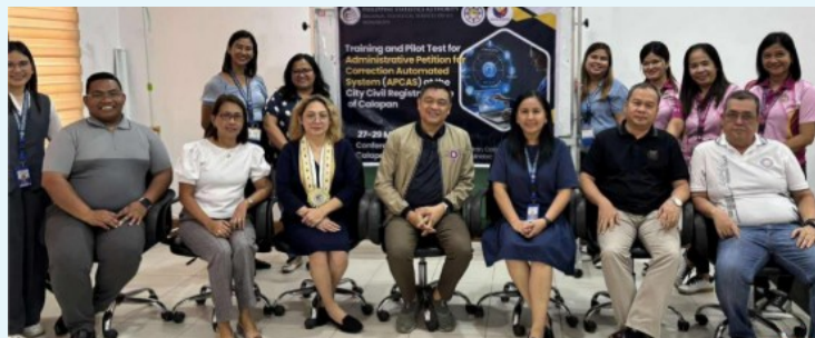
Training participants proudly pose together during the Training and Pilot Test for the Administrative Petition for Correction Automated System (APCAS), held from May 27 to 29, 2025, at Calapan City Hall.

PSA in partnership with the Local Civil Registry Office (LCRO) of Calapan City, launched the pilot implementation of the Administrative Petition for Correction Automated System (APCAS) on 27-29 May 2025. This three-day pilot activity aims to modernize the processing of administrative correction petitions by introducing an automated, streamlined system that supports the implementation of Republic Acts No. 9048 and 10172.